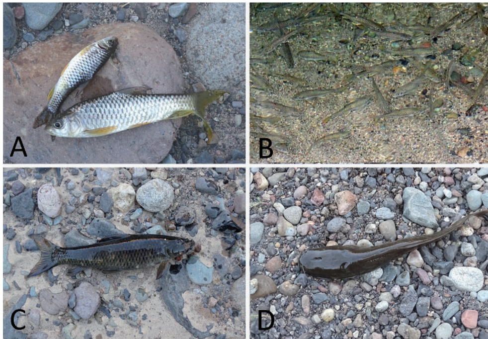
Fig. 2: Fishes from Horchi, November 2020. A Two specimens of Labeobarbus bynni occidentalis . B After the rainy season of 2020, L. bynni occidentalis occurred in large numbers in the guelta. C Labeo cf. parvus . D Clarias cf. gariepinus .

The all-younger inhabitants who were fishing at the Horchi guelta had no deeper knowledge about the fish. A man of about 70 years of age, interviewed later by the author, said that there were four different species of fish in Horchi. He could remember three of the local names (ebichī, furogaĩ, ofune), but could no longer assign them to the individual species. In his childhood, the rivers of the Western Tibesti often had so much water during rainy seasons that it seeped only when reaching the sandy dry delta fan of Madagada outside the massif, in its southwest. At that time, the inhabitants gathered there the fish that had been transported by the floods in large numbers for their own consumption.