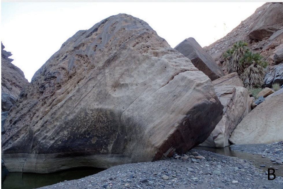
B Teil des Gueltas von Horchi (unten rechts) mit dem dieses durchfließenden Bach (rechts).