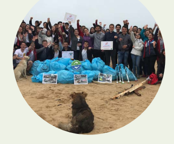
River Cleanups 2018 Turkey