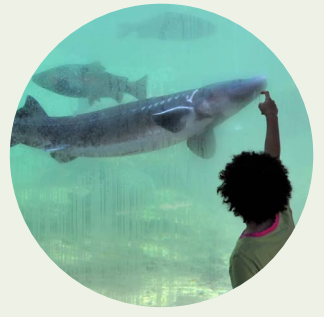
Fish Passage Education Centers USA

Dam Removals