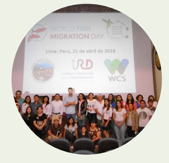
Conferences or Workshops 2018 Peru

Canoe/KayakTours 2016, USA